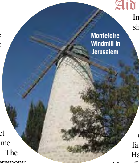
Montefiore Windmill in Jerusalem

Sir Moses Montefiore was renowned for his sharp, witty humor. A popularly-circulated account, possibly legendary, relates that at a dinner party he was once seated next to a nobleman who was known to be an anti-Semite. The nobleman told Sir Moses Montefiore that he had just returned from a trip to Japan, where "they have neither pigs nor Jews." Sir Moses Montefiore is reported to have responded immediately, "In that case, you and I should go there, so it will have a sample of each." 3